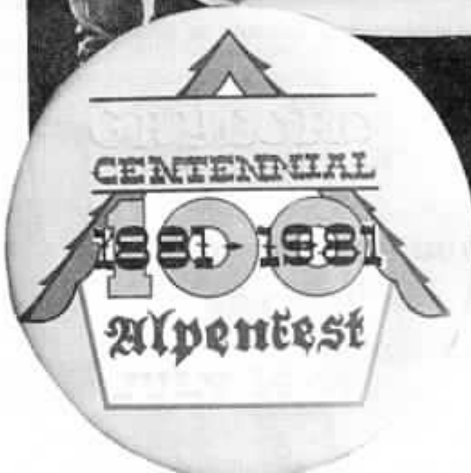
City of Gaylord's centennial coincides with 17th annual Alpenfest.

Coon was sponsored by Gaylord State Bank.