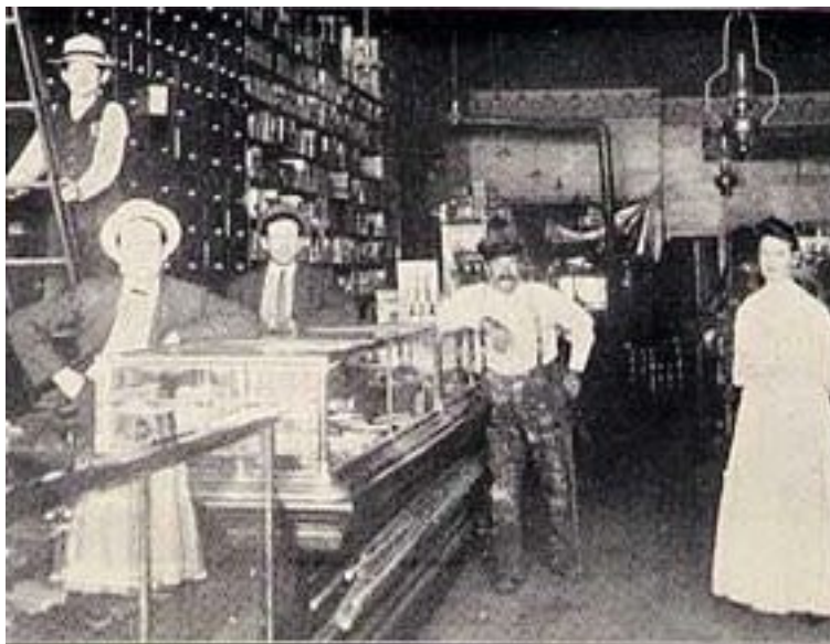
INTERIOR OF CREGO & PELTON'S HARDWARE STORE