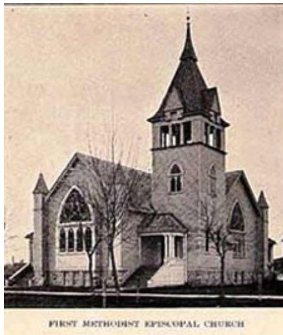
OTSEGO COUNTY HERALD Gaylord of Today - Souvenir Edition September 15, 1905