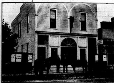
P. O. BUILDING AND R. F. D. MAIL WAGONS