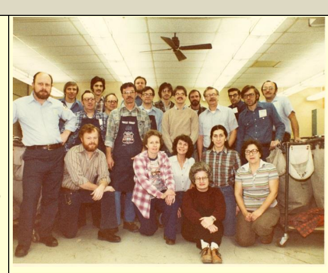
Gaylord Post Office Employees c. 1983

Help us collect and preserve this important part of our history. Share your photos like the one shown here and record your memories of our local post offices and the people who worked there. Their history matters.