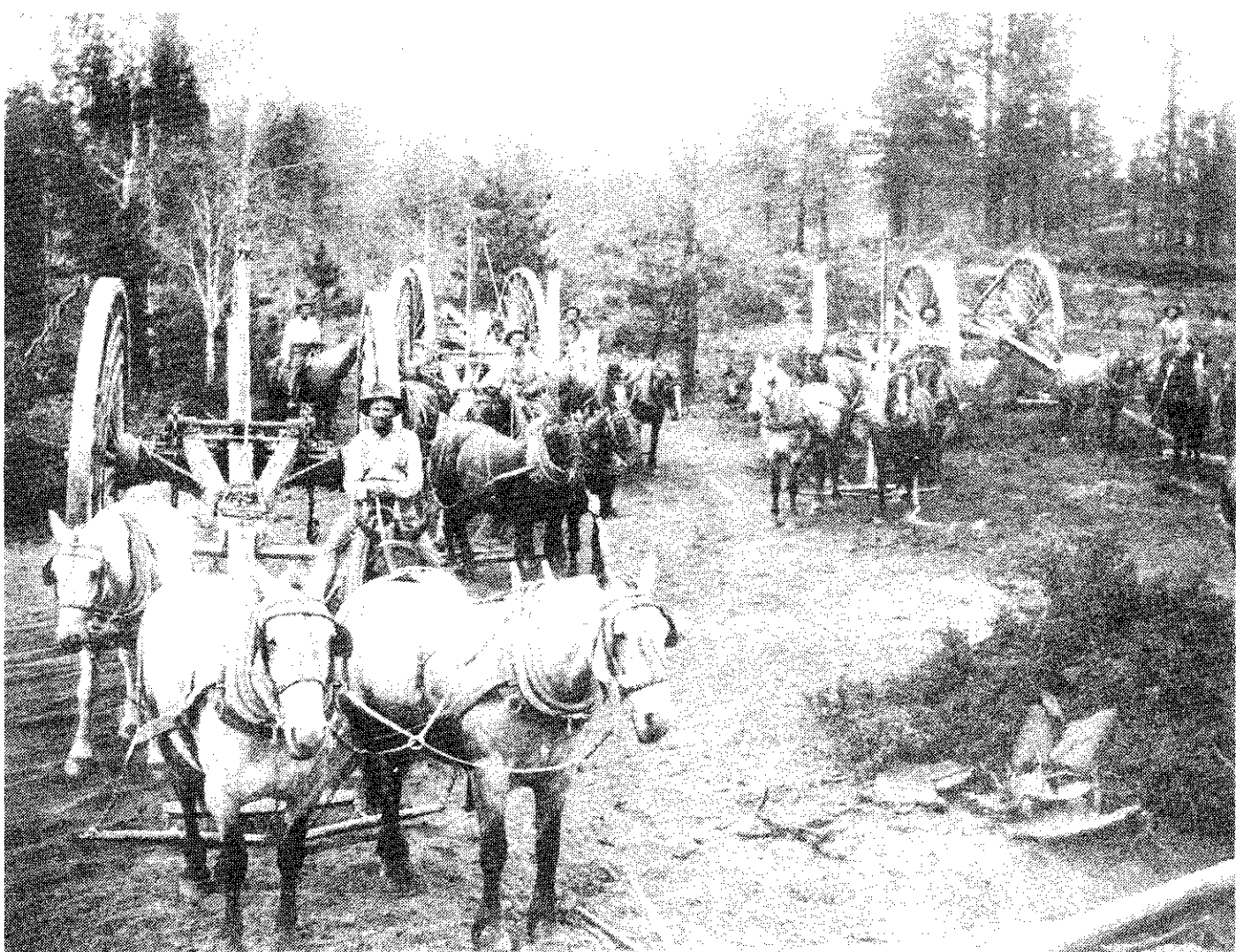
Big Logging Wheels