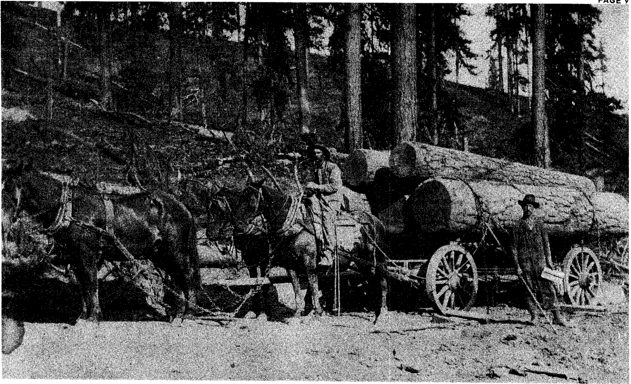
LOGGERS had their work cut out for them in the Otsego Lake area in the 1890's.