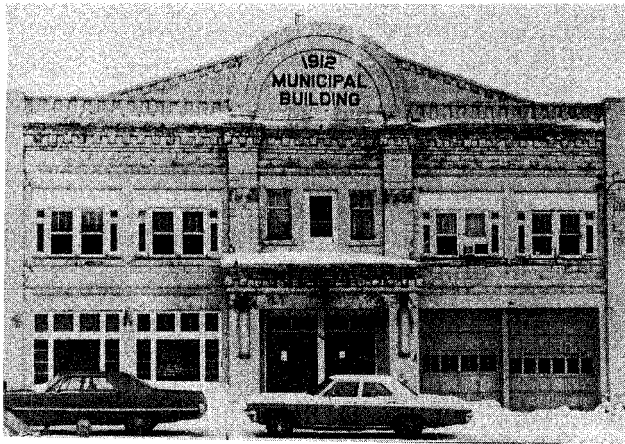
THE 1912 MUNICIPAL Building, located due east of the present City-County Building, served its purpose for several years and was later demolished.