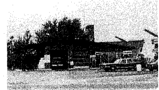
W. M-32 At I-75 Exit 282 (517) 732-9966

We're The Service People You Can Count On