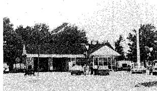
Old 27 S. At I-75 Exit 279 (517) 732-5074

Construction was recently completed on new offices for the company.