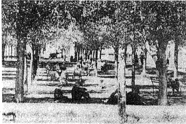
THE COURTHOUSE PARK was a center for community life in Gaylord around the turn of the century. This view of residents enjoying a sunny summer day was taken from Court Street near Main, looking west. The cannon, which still sits on the same spot on the courthouse lawn, is visible in the background. The old courthouse was located to the left of the picture.