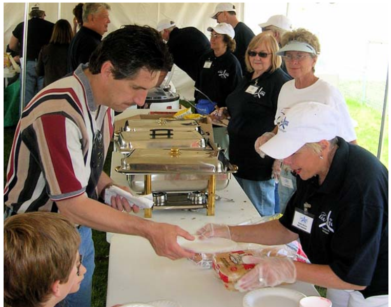
Our Charming Servers