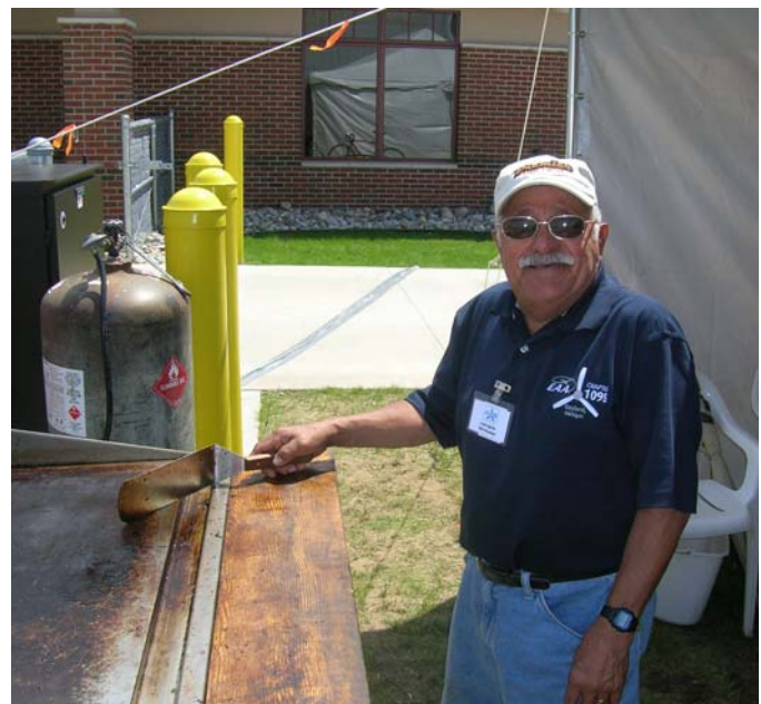
Louie the Grill Comandante