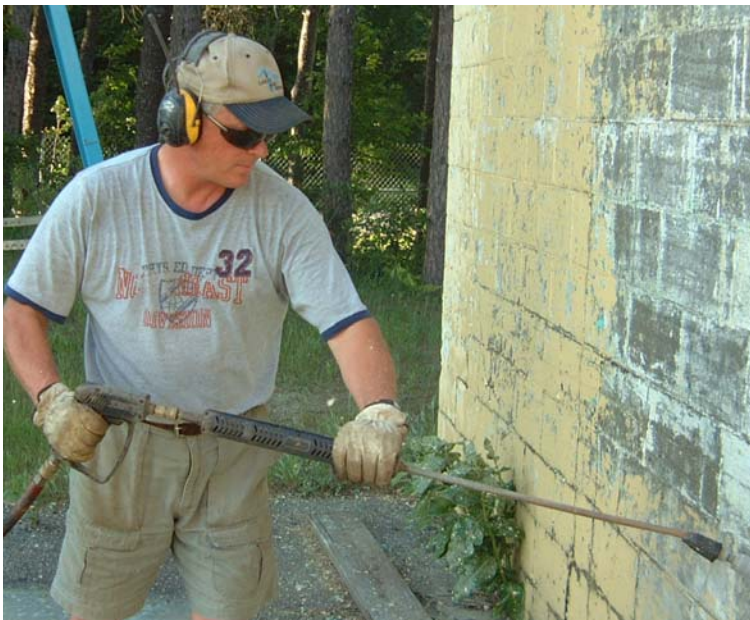
Our Master Cleaner