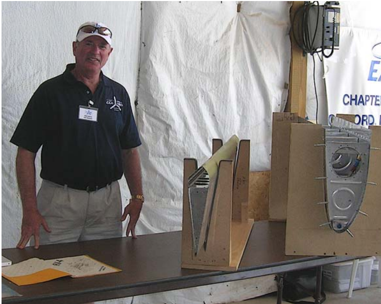
Our Master Builder