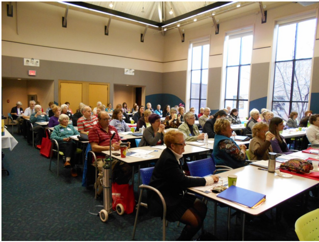
Attendees at the Canton Public Library/FOML Spring Workshop. It was a packed house!