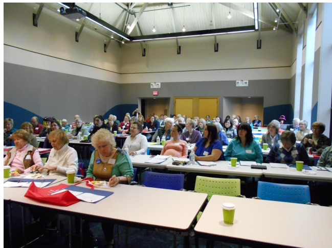
Attendees at the Canton Public Library/FOML Spring Workshop. It was another successful session.