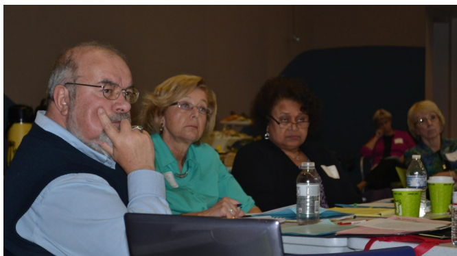
Participants follow along.